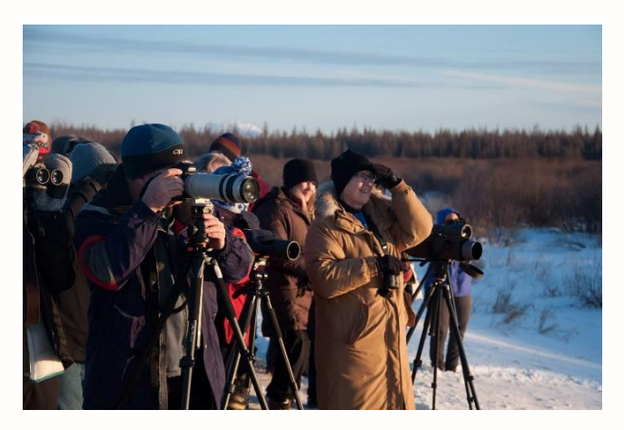
Volunteers traveled over 100,000 miles to make more than 4000 observations!

Volunteers provide citizen data from across Minnesota for projects such as: bird counts, backyard weather observations, National Eagle Center Golden Eagle Survey, Minnesota Bumblebee Survey, Citizen Stream Monitoring Program, Monarch Larva Monitoring Project, Minnesota Loon Watcher Survey.