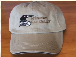
Baseball Cap One size fits most. Khaki $12.00

All clothing has the Minnesota Master Naturalist logo on it. Additional sizes may be ordered upon request, if available. An additional charge may be assessed for special orders.