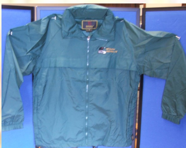
Rain Resistant Jacket Nylon jacket with hidden hood, wind and rain resistant Forest Green S-M-L-XL-2XL DISCONTINUED